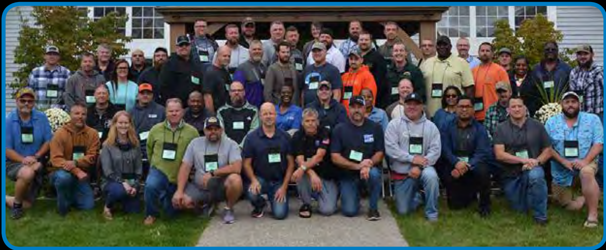
FALL CLASS OF 2025