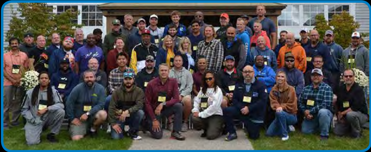
FALL CLASS OF 2024