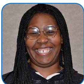
EVITA PARKS GLWA Year 2