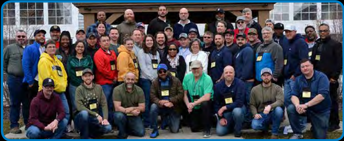
SPRING CLASS OF 2024