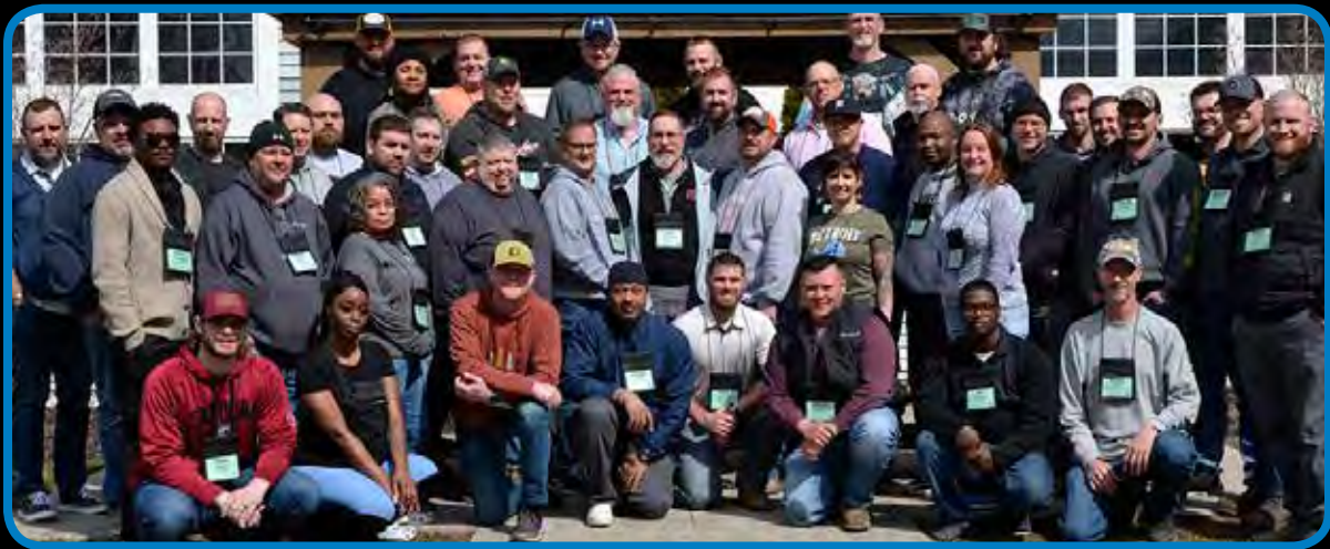
SPRING CLASS OF 2025